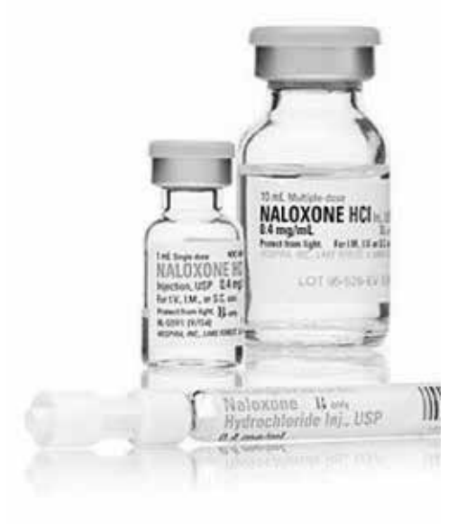
Naloxone is available in an intranasal spray and injectable fluid.

Alaska Legislature gives legal protection to first responders, pharmacists